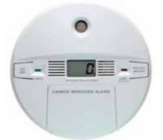
Carbon monoxide detector

Everyone! Each year: 400 Americans die, 20,000 visit the emergency room, and 4,000 are hospitalized.